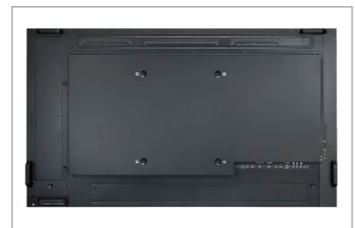
Durable metal casing