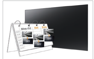
Built-in scheduler automatically activates and deactivates the PM-65 with designated input signal according to programmed schedules.