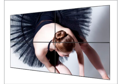
Built-in tiling function allows easy image setting in a video wall matrix (supports up to 10 x 10)