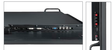
Versatile connectivity: VGA, DVI, HDMI, Composite, Component, DisplayPort