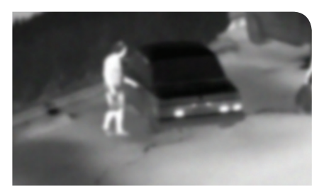
The most accurate intrusion detection and video alarm verification system available.