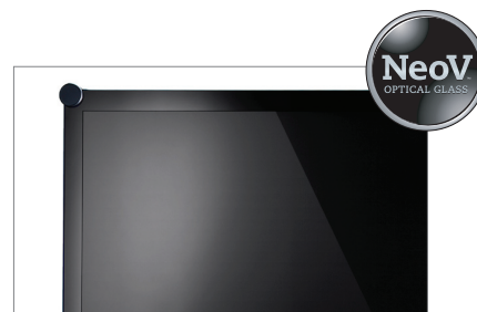
NeoV™ Optical Glass protects against scratches, impacts and other physical damage