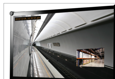
On top of PIP and PBP, Smart Omni Viewer offers selectable aspect ratios and the option of 180° image rotation