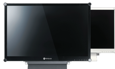
Available in black or white